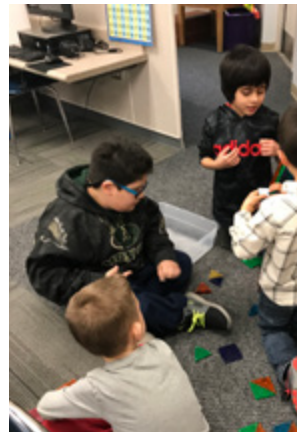
Building an awesome tower