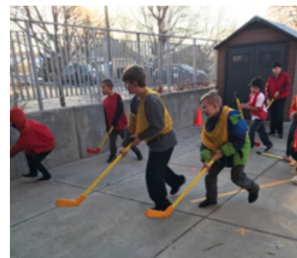
Playing hockey in Adapted P.E