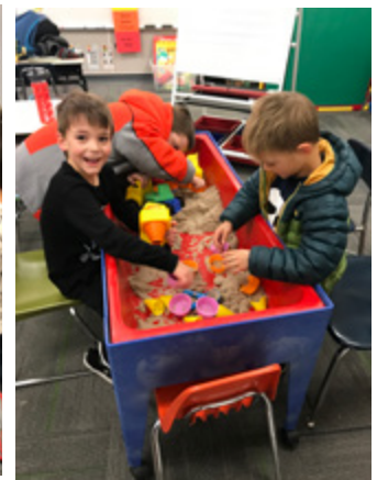
Enjoying the sand table